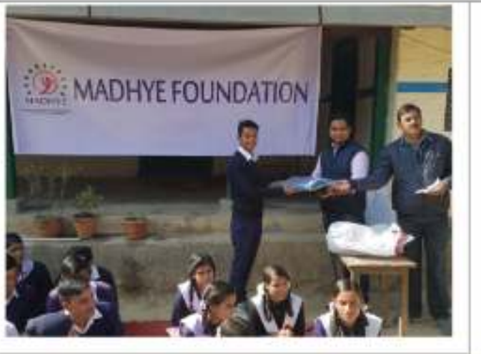
School bag Distribution at Village Guniyalekh in Uttarakhand