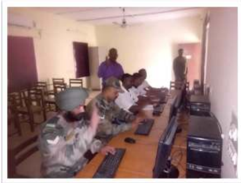
COMPUTER SYSTEM IN VT CENTER FOR JAWANS IN ROORKEE