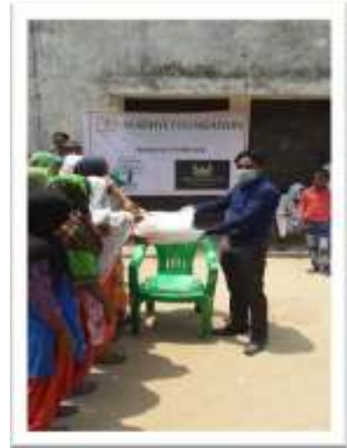
.Distribution of food packets at Village Munda at Amroha